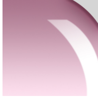
Pink - PNK