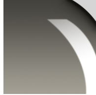
Smoke - SMK