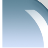
Sky Blue - SKB