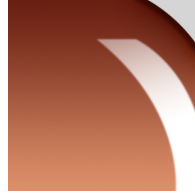
Ruby - RUB