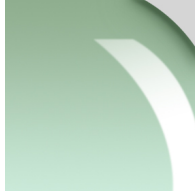
Green - GRN