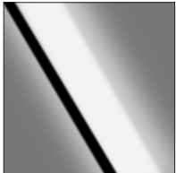
Chrome - CHR