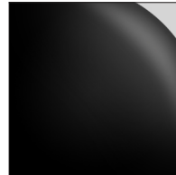
Matte Black - MBK