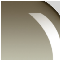
Tobacco - TOB